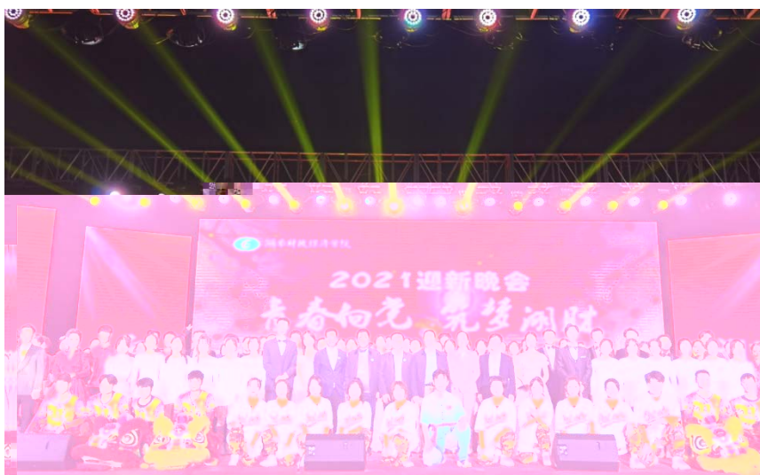
图 2021 年湖南财政经济学院迎新晚会现场